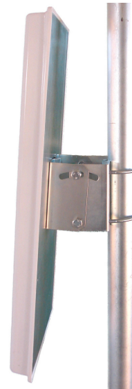
vertical polarization if mounted as shown