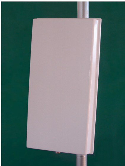
im Bild mit vertikaler Polarisation montiert

Flat panel antenna with radome for outdoor installations, 18 dBi gain. Radiation angle approx 15x30°, includes mast bracket for downtilt, mast diameter from 25 to 50mm, connector N female. Size 50x25cm, weight 1.2Kg.