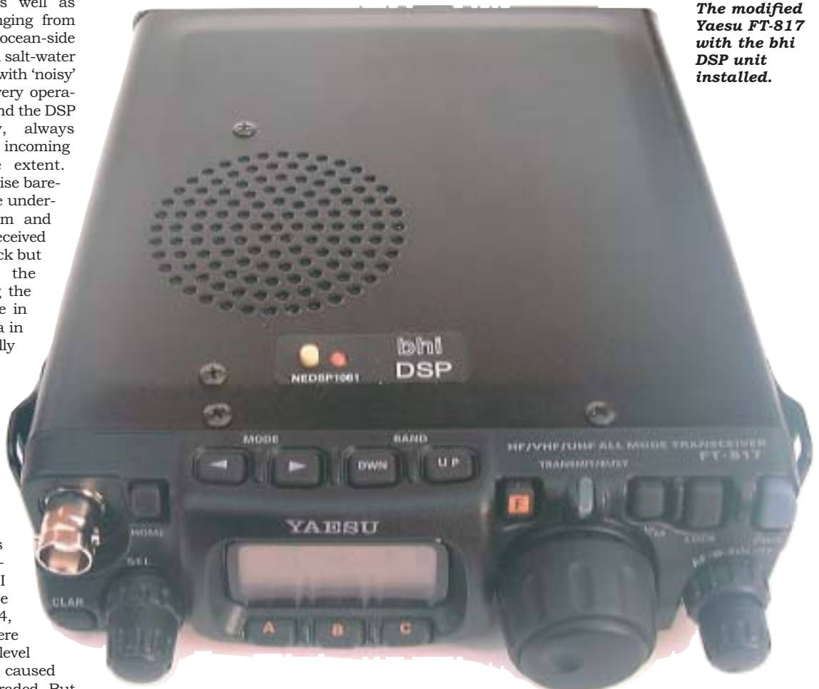
The modified Yaesu FT-817 with the bhi DSP unit installed.

www.radio.bhinstrumentation.co.uk/html/ft817_dsp.html