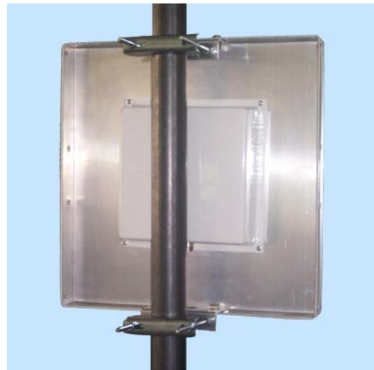
vertical polarization if mounted as shown