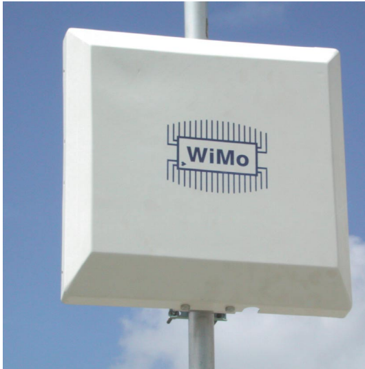
im Bild mit vertikaler Polarisation montiert

Encapsulated outdoor antenna with radome with a gain of 17 dBi. Supplied with mast bracket suitable for 35 to 65 mm dia.