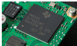
32-bit High Speed Floating Point DSP

The 32 bit high speed floating Point DSP (max 3000 MIPS) provides effective cancellation/reduction (DNR) of the random noise that is frequently frustrating in the HF frequencies. Also: the AUTO NOTCH (DNF) automatically eliminates the dominant beat tone. The CONTOUR, and the APF, are very effective receiver noise reduction tools in the HF bands operations. The YAESU original DSP QRM and noise reduction functions are provided.