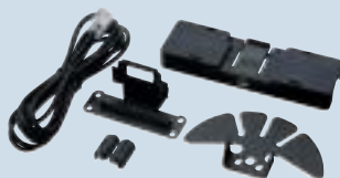
■ DFK-3D Quick-Release Detachable Front Panel Kit* *Includes quick-release panel, panel mount & cushion, 9.9ft/3m panel cable.

Not all accessories are available in all markets. For availability, contact your nearest dealer.