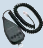
■ MC-45 Hand Microphone