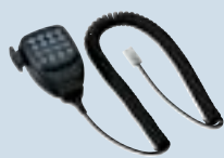
■ MC-59 16-Key Hand Microphone